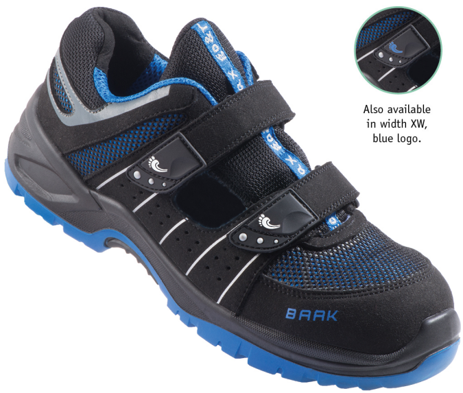
Also available in width XW, blue logo.